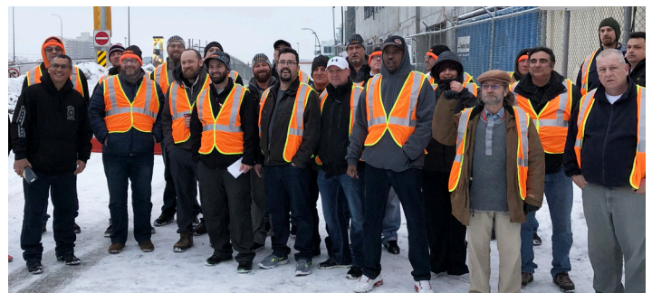
2018 Canadian 5-day participants

Northwest Regional Conference - July 29-31, 2019 Lake Tahoe, NV